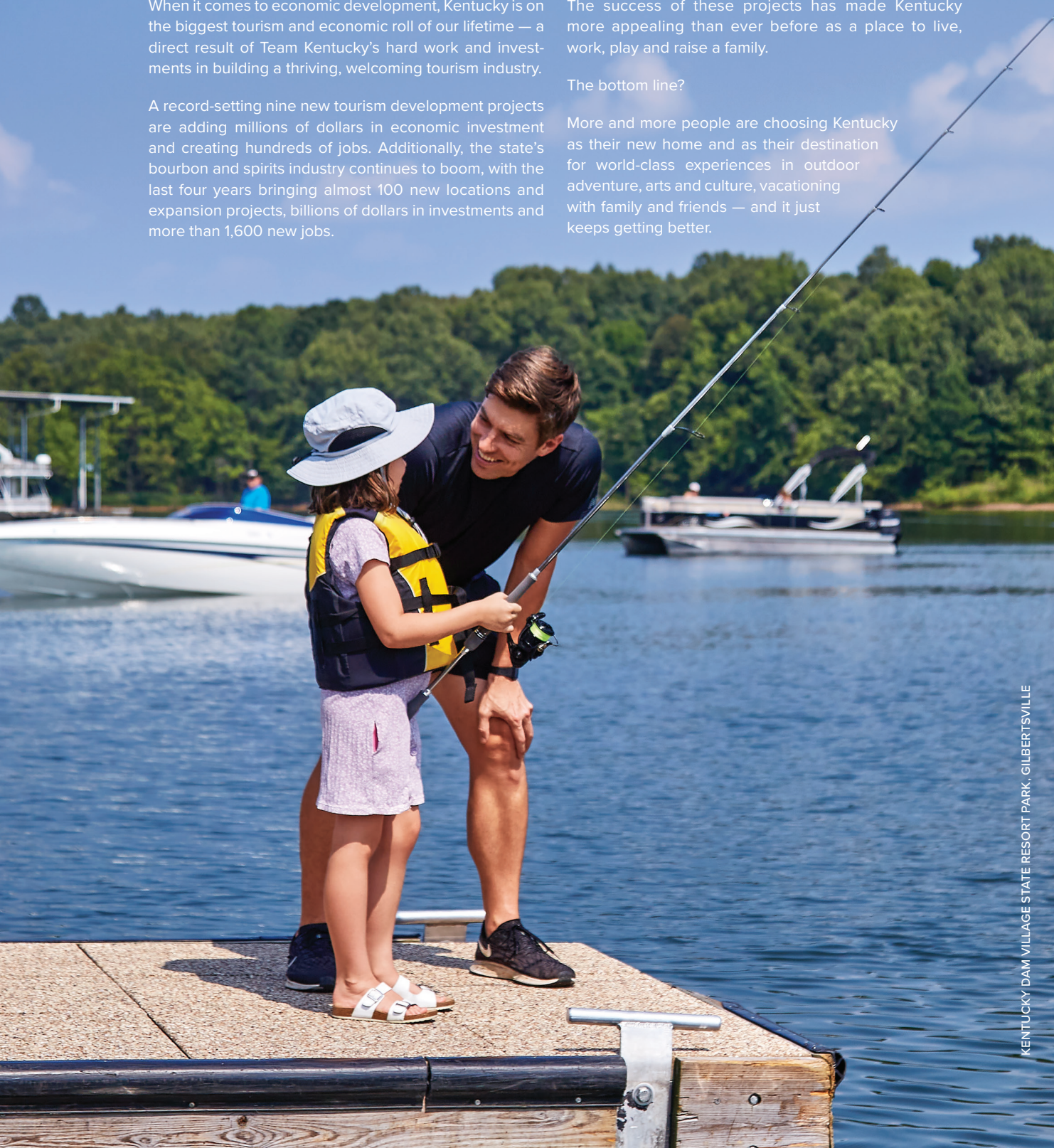
KENTUCKY DAM VILLAGE STATE RESORT PARK, GILBERTSVILLE

More and more people are choosing Kentucky as their new home and as their destination for world-class experiences in outdoor adventure, arts and culture, vacationing with family and friends — and it just keeps getting better.